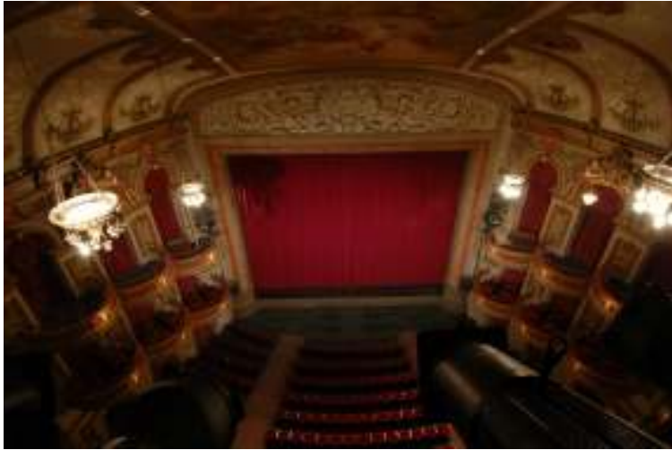
The Wells Theatre, Norfolk, Virginia - Home of Virginia Stage Company

Virginia Stage Company is the region's only fully professional resident theater company, serving an audience of more than 90,000 yearly. Founded in 1968, VSC's mission is to enrich, educate and entertain the region by creating and producing theatrical art of the highest quality and worthy of national prominence. As a non-profit cultural institution, VSC is an artistically driven theater rather than a commercial venture. Contributions from government agencies, corporations, foundations and individuals enable VSC to keep ticket prices affordable for all citizens of the Hampton Roads community while sustaining the highest artistic integrity. Virginia Stage Company's Education Department provides student matinee performances of mainstage productions as well as in-school touring productions to over 40,000 Hampton Roads students annually. VSC also participates as a Partner in Education with several schools by providing services such as performances, drama classes, production training and workshops to Title One schools. Virginia Stage Company also provides a variety of services and programs to our community, including American Sign Language performances and infrared hearing devices for patrons with hearing difficulties.